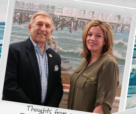
Thoughts from our President & CEO & Executive Director

Seashore Gardens Living Center Established 1916