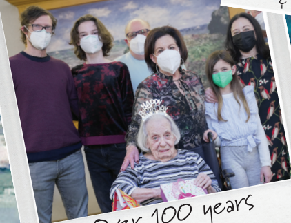
Over 100 years of Celebrations