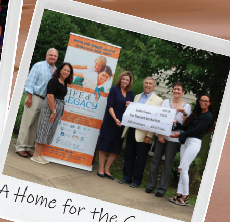
A Home for the Gardens

22 W. Jimmie Leeds Road, Galloway Township, NJ 08205 (609) 404-4848 ■ www.seashoregardens.org