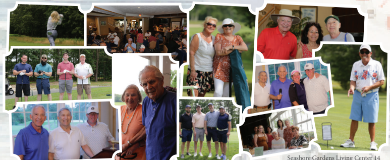
Seashore Gardens Living Center 14