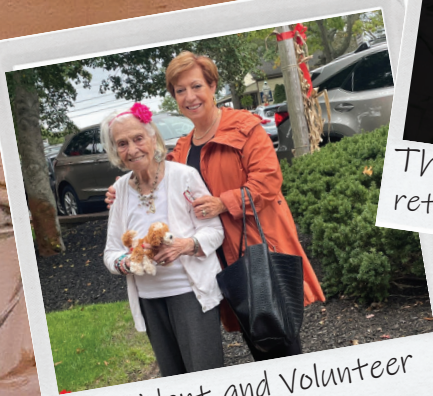
Resident and Volunteer Mother and Daughter