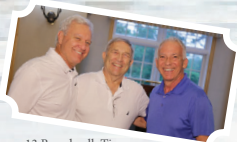
13 Boardwalk Times

Mark your calendars on June 21, 2023 for Seashore Gardens Foundation Golf Tournament