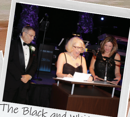
The Black and White Ball returned October 29, 2022